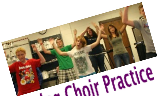
Swing Choir Practice

Then on Sept. 29th, most of the high school band attended THE BLUE MAN GROUP at the Lied Center in Lincoln. Southern Music Boosters covered half of the cost of a student ticket which made it very affordable for the students to attend a professional concert.