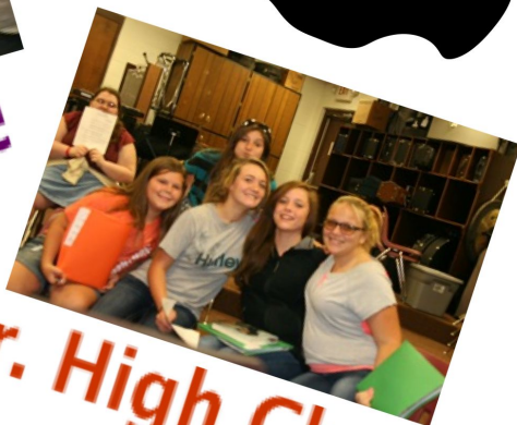
Jr. High Choir