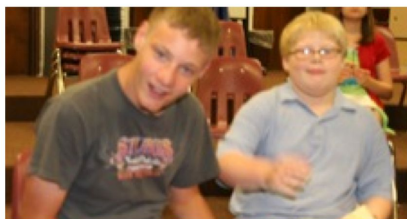
Jr. High Choir