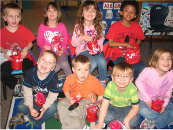
On February 14th, the Little Raider Preschool had their Valentine's Day Party. They exchanged valentines and played Memory and Valentine's Bingo!