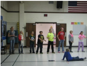
Left & Right: The elementary celebrated Christmas on Dec. 21st with class parties. In the afternoon, the students enjoyed watching the movie "Brave" while eating popcorn and drinking juice. The day concluded with the annual Christmas sing-a-long.